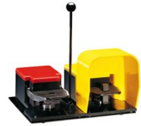
Two pedal, left pedal with free actuation and right pedal with safety lever - left open right with cover KG D003